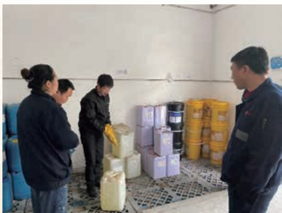
Hazardous Chemical Handling Safety Training

For our new employees, the Group offers induction training prior to the commencement of work. By understanding the corporate development and culture, corporate rules and regulations, as well as employee welfare and benefits, new staff can easily adapt to the new work place. Besides, we provide comprehensive on-job training for our people. Different types of support and training opportunities allows our employees to develop their professional and technical skills for the relative job positions, as well as growing their personal capability. Occupational safety training sections are arranged to ensure our employees understand the occupational health risks and can work under a safe condition. Apart from basic trainings, outstanding staff have opportunity to attend professional training to unleash their potentials in management skills. Professionals and expertise are invited to hold seminars and provide updates on the market trends, which remains our competitiveness in the industry. During the Reporting Period, we organised various trainings such as hazardous chemical handling training and internet fraud prevention training for our people.