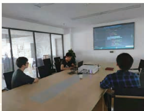
Innovative Information Technology Sharing